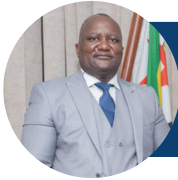
Hon. Ezra Chadzamira Minister of State for Provincial Affairs and Devolution

Welcome to Masvingo Province, a land imbued with profound historical significance as the very heart of Zimbabwe’s origins. This majestic Province was once the citadel of the Great Kings of the Munhumutapa Empire and is proudly recognized as the “Cradle Of Our National Heritage”, home to the iconic Great Zimbabwe Monuments. Our Provincial leadership remains committed to upholding and continuing the legacy of our forebears, the illustrious Munhumutapa kings, whose enduring spirit guides our development journey. Inspired by the visionary leadership of His Excellency, President Cde Dr. E.D. Mnangagwa, who has charted the transformative development trajectory towards Vision 2030—An Empowered, Middle-Income Society—we are actively working to create an enabling environment that fosters investment, growth, and prosperity. It is with this shared vision that we invite prospective investors to explore the abundant opportunities within Masvingo Province.