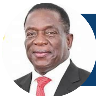
His Excellence, the President of the Republic of Zimbabwe, Dr. Emmerson D. Mnangagwa

The Republic of Zimbabwe is working towards an upper-middle-income society to become a prosperous and empowered nation by 2030; the Masvingo Province is ideally well-positioned to attract investments. The province is strategically located as a trade route to various African markets due to its proximity to major transportation corridors and neighboring countries, such as the north-south corridor (South Africa-DRC Congo) and regional trade areas (Mozambique, Botswana, and Zambia).