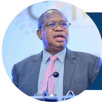
Hon. Prof. Mthuli Ncube Minister of Finance, Economic Development and Investment Promotion

I am delighted to reach out to Masvingo Province on its track to drive investment opportunities, targeting to grow the GDP to $8 billion by 2030, from the current US$1.8 billion. With its rich history, the province is always instrumental in contributing to the national growth of domestic product (GDP).